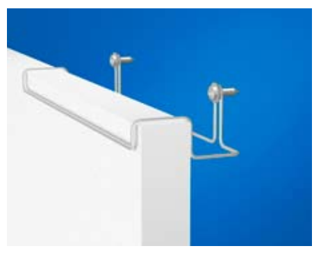
Detail of Hygiene Foodtec Wall C3