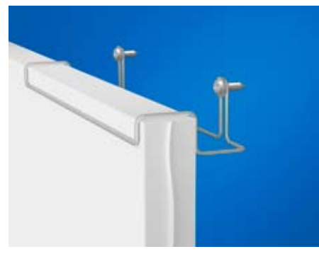
Detail of Hygiene Advance Wall C3

Withstands cleaning with water at high or low pressure twice a year and wet wiping once a week with commonly used detergents and disinfectants.