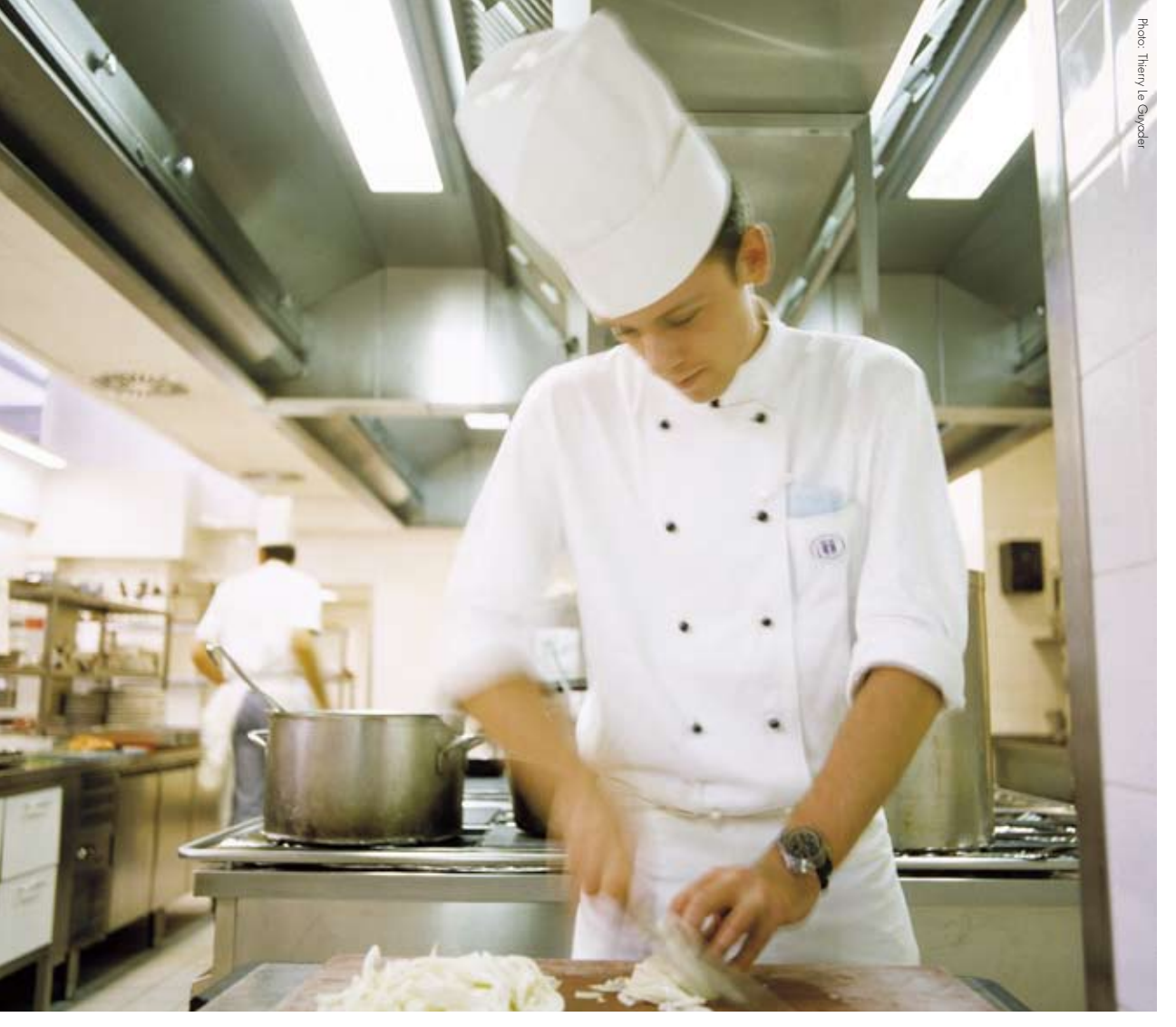
A good sound environment creates better conditions for work that needs a high level of concentration.