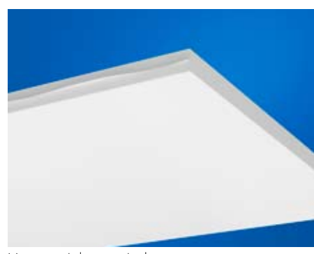
Hygiene Advance A tile