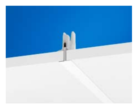
Hygiene Foodtec A C3 section with Connect Hygiene clip 20