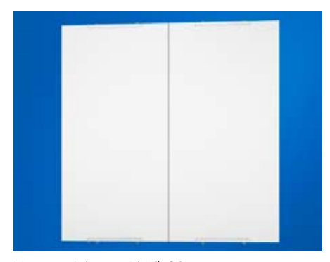
Hygiene Advance Wall C3 system