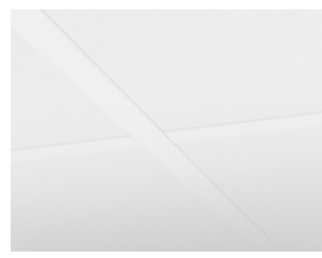
Hygiene Foodtec A C3 system